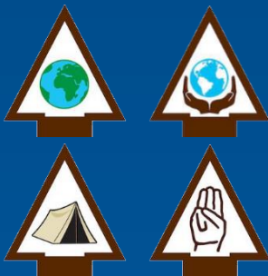
Building a Better World, Duty to God in Action, Outdoor Adventurer, Scouting Adventure

Fifth graders work toward the Arrow of Light rank. If a fourth-grade Cub Scout has completed the Webelos rank, they may begin to work on the Arrow of Light. The Arrow of Light rank is earned by completing five adventures as described below.