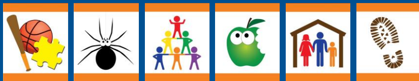
Games Tigers Play, My Tiger Jungle, Team Tiger, Tiger Bites, Tiger Circles: Duty to God, Tigers in the Wild

First graders work toward the Tiger rank. The Tiger rank is earned by completing seven adventures as described below. Although participation with an adult partner is required for all Tiger awards, recognition items are for the Scouts only.