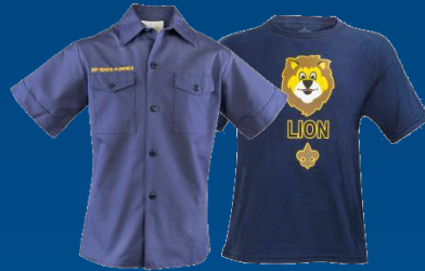
Blue Uniform Shirt or Lion T-Shirt