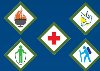
Cast Iron Chef, Duty to God and You, First Responder, 'Stronger, Faster, Higher', Webelos Walkabout