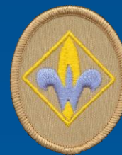
4th Grade Webelos