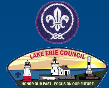
World Crest/Council Shoulder Emblems