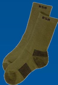
COOLMAX Uniform Crew Socks