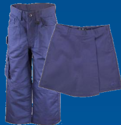
Youth Switchback Uniform Pants/Skort