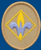
4th Grade Webelos

Fourth graders work toward the Webelos rank. The Webelos rank is earned by completing six adventures as described below.