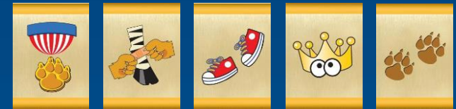
Lion's Honor , Animal Kingdom , Fun on the Run! , King of the Jungle , Mountain Lion

First graders work toward the Tiger rank. The Tiger rank is earned by completing seven adventures as described below. Although participation with an adult partner is required for all Tiger awards, recognition items are for the Scouts only.