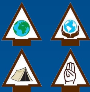
Building a Better World, Duty to God in Action, Outdoor Adventurer, Scouting Adventure

Fifth graders work toward the Arrow of Light rank. If a fourth-grade Cub Scout has completed the Webelos rank, they may begin to work on the Arrow of Light. The Arrow of Light rank is earned by completing five adventures as described below.