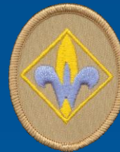
4th Grade Webelos