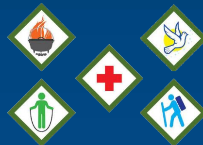
Cast Iron Chef, Duty to God and You, First Responder, 'Stronger, Faster, Higher', Webelos Walkabout