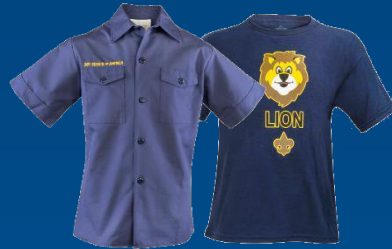
Blue Uniform Shirt or Lion T-Shirt