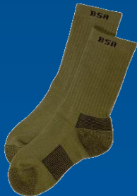
COOLMAX Uniform Crew Socks