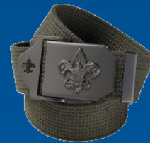
Boy Scout Web Belt