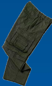
Youth Canvas Convertible Pants