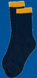
COOLMAX Uniform Crew Socks