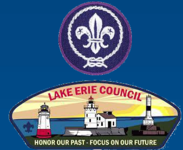
World Crest/Council Shoulder Emblems