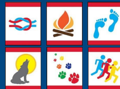
Call of the Wild, Council Fire (Duty to Country), Duty to God Footsteps, Howling at the Moon, Paws on the Path, Running With the Pack