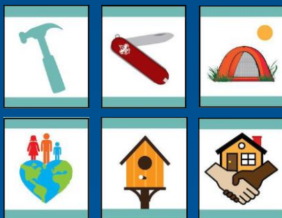
Baloo the Builder, Bear Claws, Bear Necessities, Fellowship and Duty to God, 'Fur, Feathers, and Ferns', Paws for Action (Duty to Country)

Third graders work toward the Bear rank. The Bear rank is earned by completing seven adventures as described below.