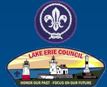
World Crest/Council Shoulder Emblems