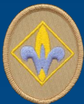
4th Grade Webelos

Fourth graders work toward the Webelos rank. The Webelos rank is earned by completing six adventures as described below.